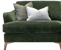
W- 114cm H- 87cm D- 103cm