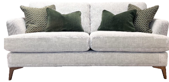
W- 196cm H- 87cm D- 103cm