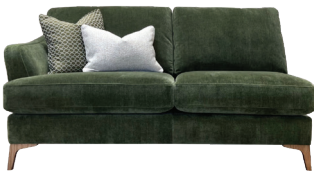
W- 177cm H- 87cm D- 103cm