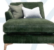
W- 100cm H- 87cm D- 161cm